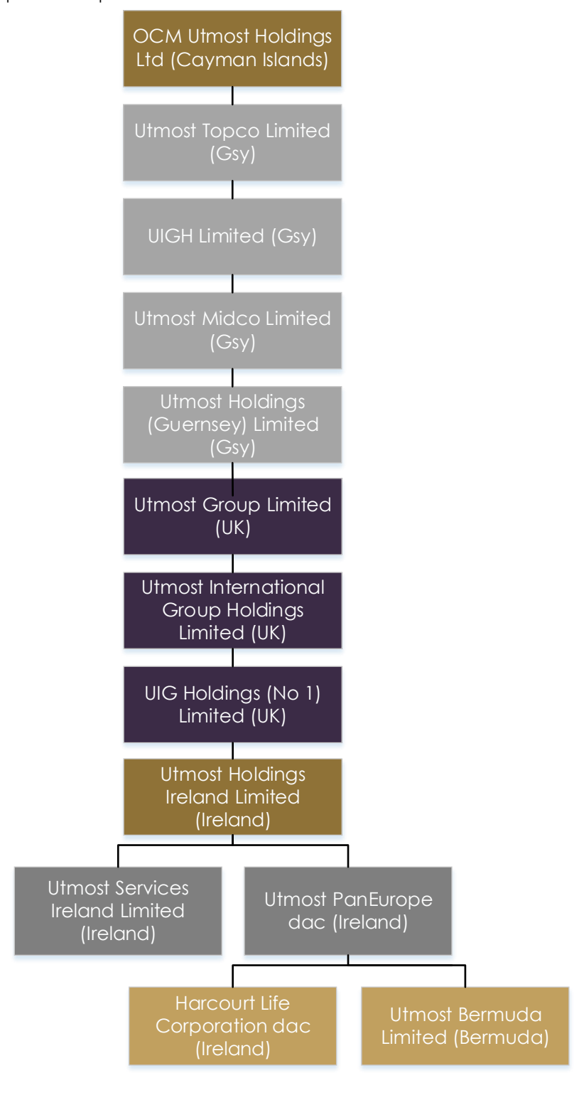
Exhibit 1 Group Ownership Structure at 31st December 2020